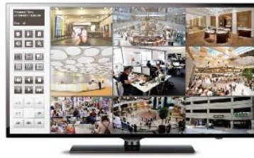
Afidus CMS / 256 CH CMS