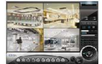
NVR 64 / 64CH NVR